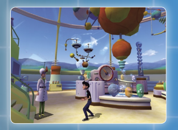
The Robinson Home Attempt to "borrow" the Time Machine